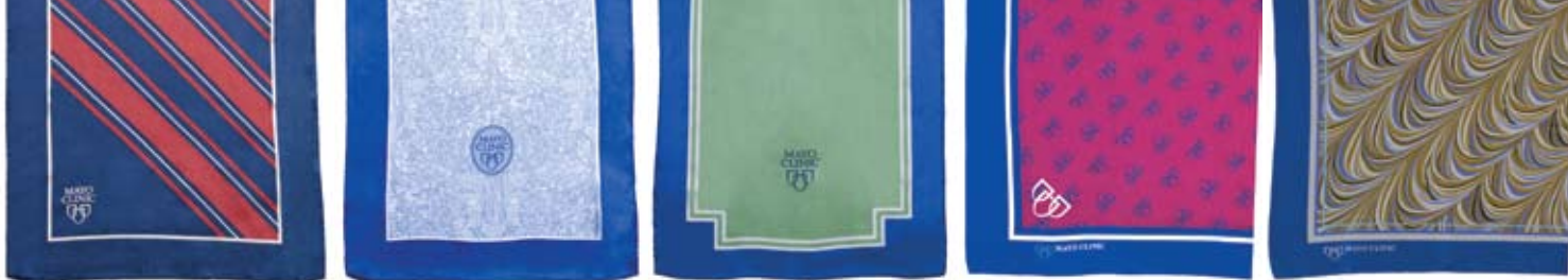
S-1 S-2 S-3 S-4 S-5